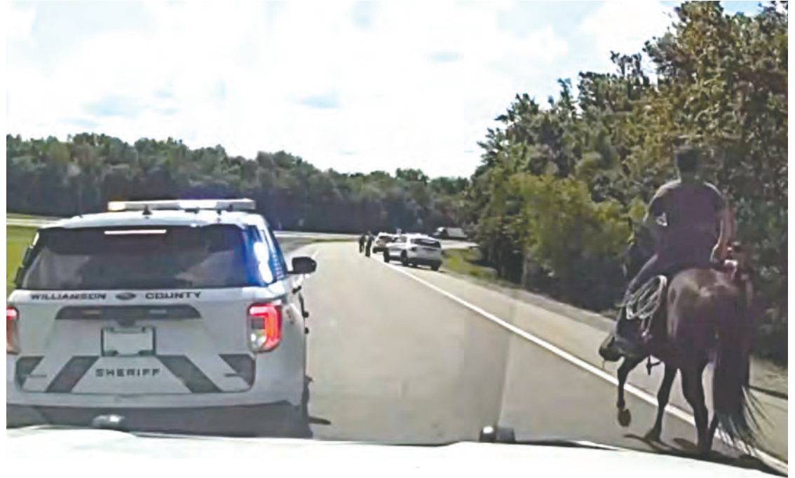
Dash-cam video shows a local cattleman on horseback in pursuit of runaway bull on the I-57 entrance ramp in Johnston City.