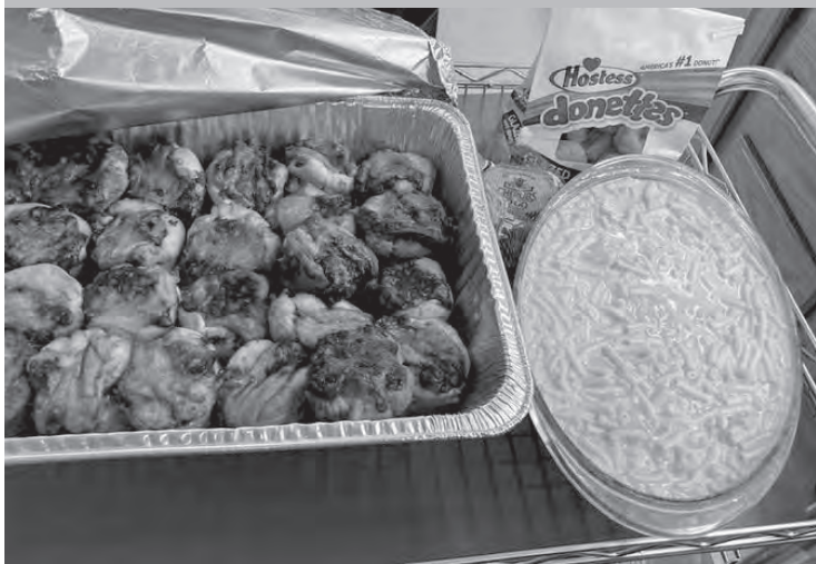
ONE OF MANY HOT MEALS SERVED AT THE CENTER

but the aging structure proved too costly to renovate. As the church considered other options, First Christian Church expressed a desire to sell a property adjacent to JCity Church's parking lot. The two churches agreed on price and terms to transfer ownership of a former parsonage—a 12-room, 3,200 square foot, brick, ranch-style home—that would house this effort. In the midst of the COVID pandemic, JCity Church spun off this new nonprofit community development organization. JCity Center for Hope and Renewal, Inc. was chartered in the State of Illinois and federally recognized as a 501c3 nonprofit charitable organization in 2020.