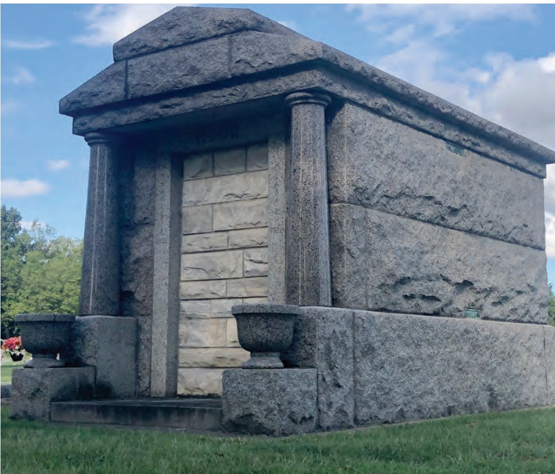
This 100-year-old mausoleum near the entrance of Lakeview Cemetery in Johnston City, popularly known as Hook's Tomb, has been the subject of a local ghost story for at least 50 years.

Hook's Tomb has made the list of haunted places in Illinois, and the phenom-