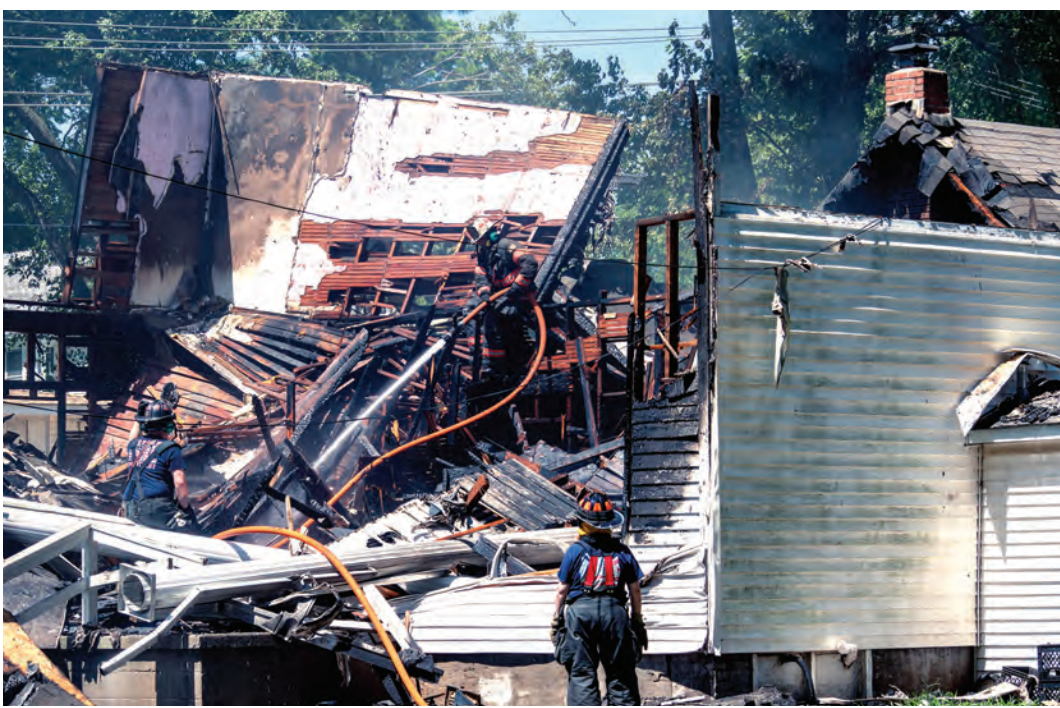
Fire departments from Johnston City, Williamson County, Herrin, and Lake of Egypt battle house fire at 606 E. 7th St. in Johnston City.

Around 10:30 am, August 22, residents near Barham and 7th heard a loud blast and saw smoke billowing from the roof of the 2-story home at 606 E. 7th St. Local first responders report that the lone occupant of the residence was rescued from the home by a neighbor and transported by United EMS to the