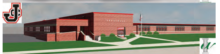
ABOVE: Volunteers from Laborers' Union Local 773 recently spent a weekend installing new playground equipment at Lincoln School.