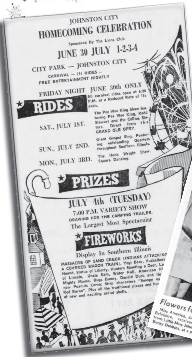
ABOVE: An ad from the Southern Illinoisian , June 29, 1967, touts "the Largest, Most Spectacular Fireworks Display in Southern Illinois." RIGHT: Clipping from July 6, 1969 pictures locals with Miss America Judi Ford.