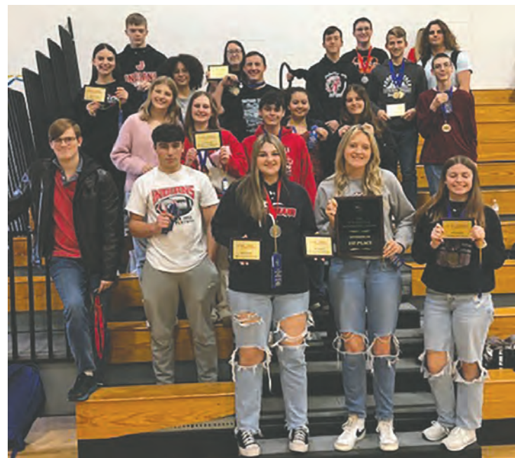
JCHS Math Team