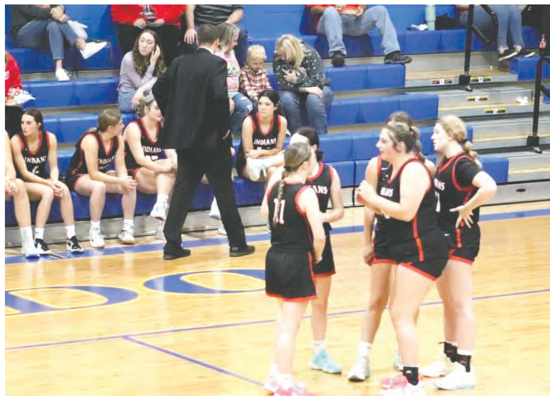
TEE PEE TALK PHOTO