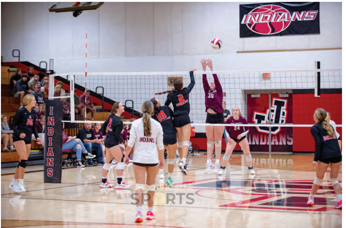
FINAL HOME MATCH for Indian Volleyball ends with 2-0 win over Sesser-Valier.

"This is one of several Road Runners I've owned,"