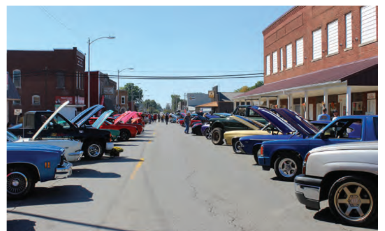
WORKMEN PAVE DOWNTOWN PARKING LOT (left). The City's annual car show last year filled downtown Broadway with classic and unique cars, trucks, and motorcycles (right).