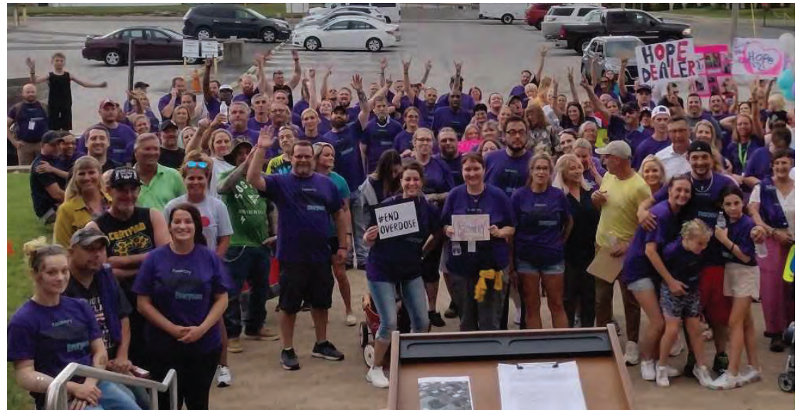
3RD ANNUAL WALK FOR RECOVERY (above) sponsored by Take Action Today and Southern Illinois Recovery Network attracted over 200 participants